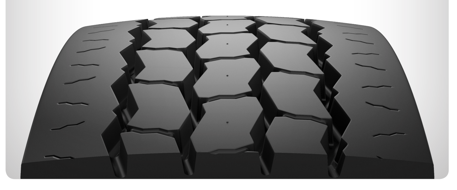
Improved Traction 26/32" Tread Depth Long Wear Life

Ideal for refuse fleets striving to lower their tire cost per mile through long wear and durability.